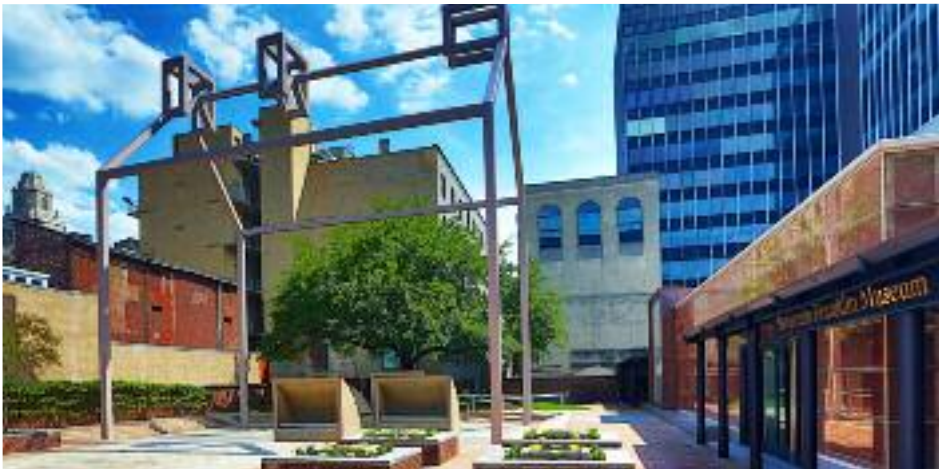
The Franklin Court site of Ben’s thought-provoking new museum is outlined by a huge metal skeletal “ghost house” of his original home and print shop.

Opened on August 24th, this 21st century treasure-trove of “please touch” exhibits, computer-animated games, 3D simulations, and other interactive devices, is a $23 million high-tech exploration of Philadelphia’s favorite citizen.