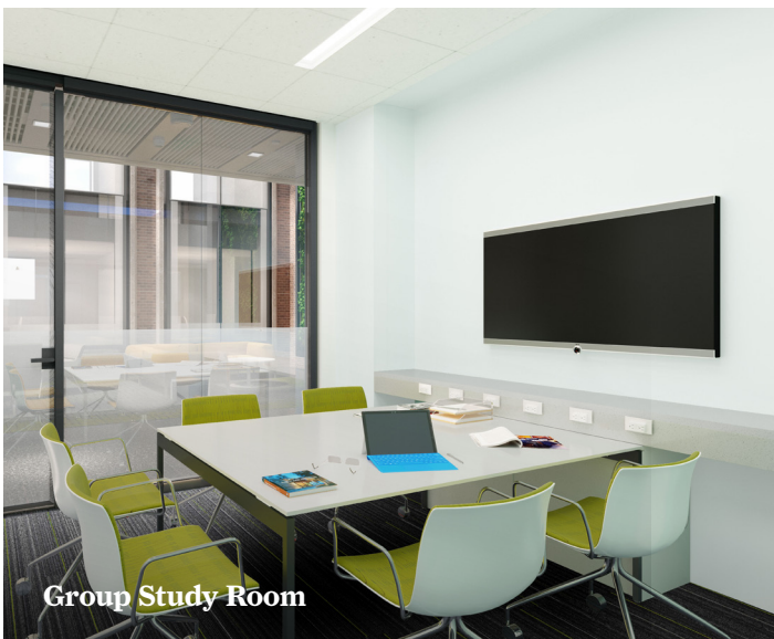
Group Study Room