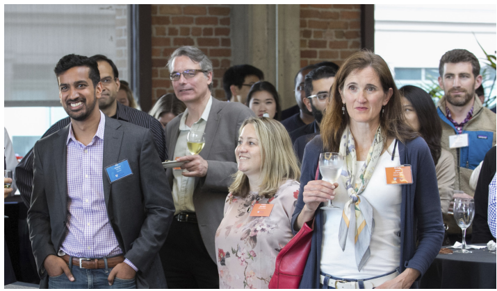
Angel Networking Initiative